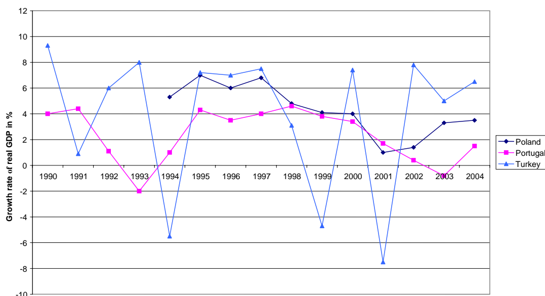
Figure 1. The growth record over the last decade

country has a similar record. The experience of Poland and Portugal, which both underwent deep structural change, seems positively stable when viewed against that of Turkey.